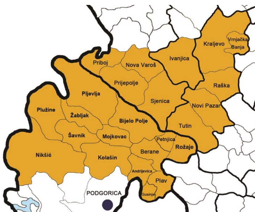
Map of the programme area

The programme area is predominantly mountainous with well-preserved nature. The most important nature resources include forests, water and mineral resources.